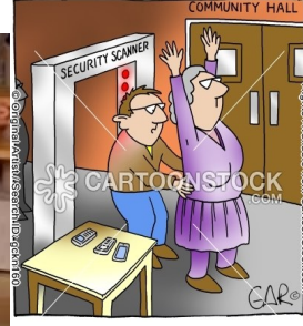
"Sorry Mable, you know the rules, no mobile devices allowed on quiz nights."